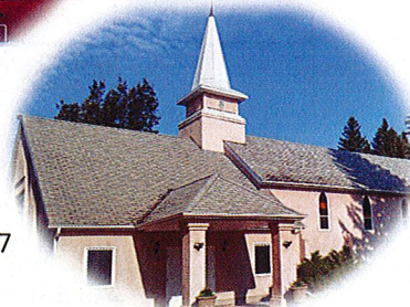
St. Margaret Mary Parish

8 St. Clair St. Devon, AB T9G 1J3 Phone: (780) 987-2858 Fax: (780) 987-2837 Parish E-mail : dcc2006@telus.net www.smgparish.ca