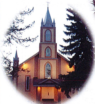
Our Lady of Victory Parish