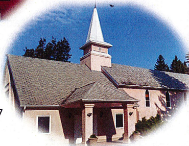
St. Margaret Mary Parish

Catholic Archdiocese of Edmonton— https://www.caedm.ca