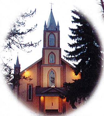
Our Lady of Victory Parish