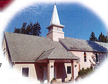
St. Margaret Mary Parish

Catholic Archdiocese of Edmonton— https://www.caedm.ca