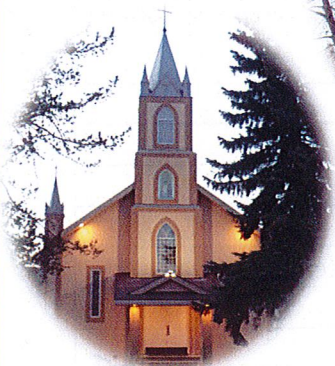
Our Lady of Victory Parish