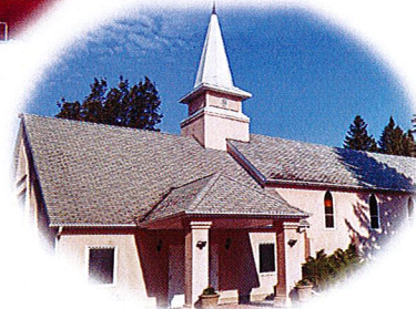
St. Margaret Mary Parish

St. Maria Goretti Parish 8 St. Clair St. Devon, AB T9G 1J3 Phone: (780) 987-2858 Fax: (780) 987-2837 Parish E-mail : dcc2006@telus.net www.smgparish.ca