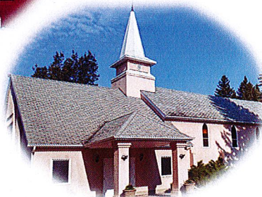
St. Margaret Mary Parish

St. Maria Goretti Parish 8 St. Clair St. Devon, AB T9G 1J3 Phone: (780) 987-2858 Fax: (780) 987-2837 Parish E-mail : dcc2006@telus.net www.smgparish.ca