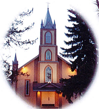
Our Lady of Victory Parish