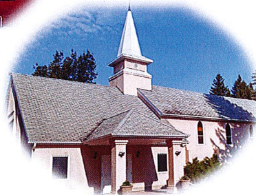
St. Margaret Mary Parish

St. Maria Goretti Parish 8 St. Clair St. Devon, AB T9G 1J3 Phone: (780) 987-2858 Fax: (780) 987-2837 Parish E-mail : dcc2006@telus.net www.smgparish.ca