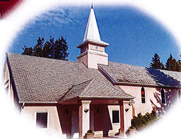
St. Margaret Mary Parish

St. Maria Goretti Parish 8 St. Clair St. Devon, AB T9G 1J3 Phone: (780) 987-2858 Fax: (780) 987-2837 Parish E-mail : dcc2006@telus.net www.smgparish.ca