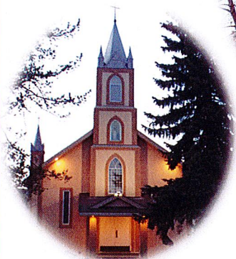
Our Lady of Victory Parish