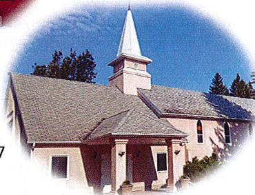
St. Margaret Mary Parish

Catholic Archdiocese of Edmonton— https://www.caedm.ca