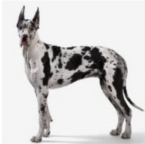
"Was that the microwave beeping? I like my Danishes nice and warm."