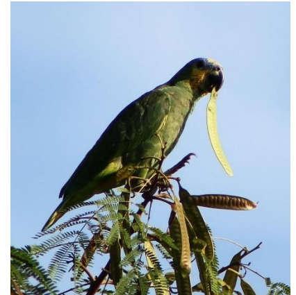
A wild orange-winged amazon foraging on a treetop.

Like many species of amazon parrots, orange-winged amazons are prized as pets, and many wild amazons are stolen from the wild to be sold internationally in the pet trade. Since 1981, when it was first listed with CITES, over 250,000 wild-caught orange-winged amazons were recorded on the international pet trade, with the United States being the largest importer of wild parrots prior to 1992. In 1992, the U.S. Wild Bird Conservation Act banned the importation of wild-caught parrots in the U.S., and it is believed this act dropped the annual number of imported parrots from over 100,000 to only hundreds. Sadly, while this act reduced the number of birds stolen from their wild homes, many wild-caught birds are still illegally smuggled into the U.S. and many more die during capture or transport. Because parrots live a very long time, many parrots kept as pets today were caught in the wild decades ago. We can help protect wild amazon parrots by not participating in the pet trade and instead supporting the rescue, rehoming, and sanctuary living of parrots already under human care.