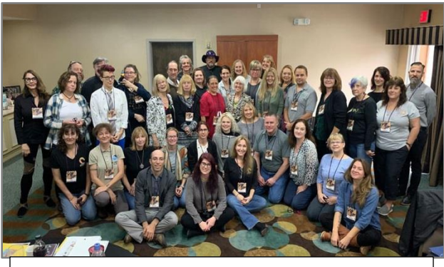
Charter members of the Parrot Conservation Alliance

learn more effectively from each other, and create new avenues for working together on behalf of all parrots everywhere. It was an incredible weekend learning from, and getting to know, some truly amazing people working in solidarity to increase protection for all parrots everywhere.