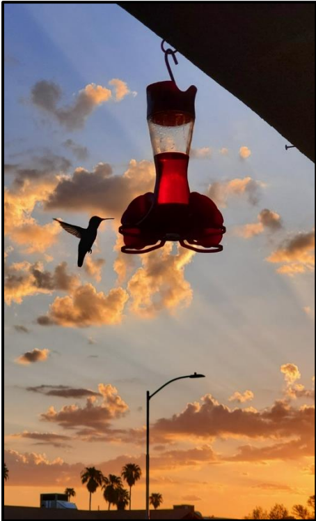
This bird swooped in just as the sun rose