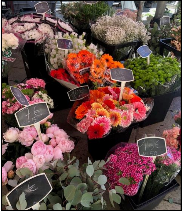
And these in an Aix en Provence flower market