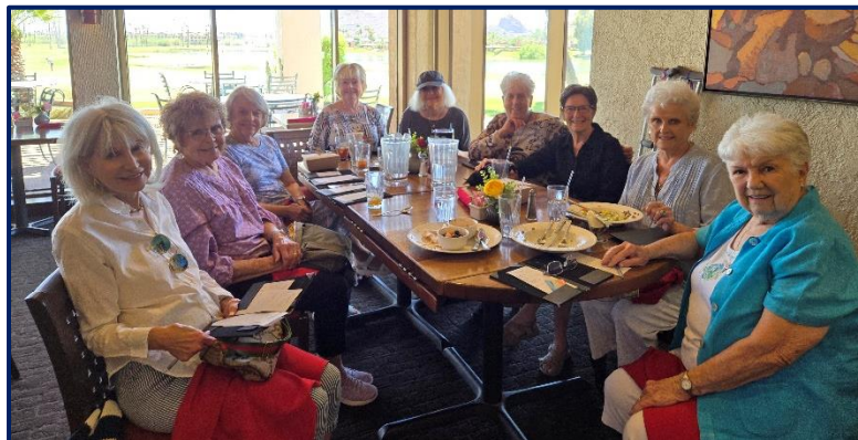
In June several members met for lunch!