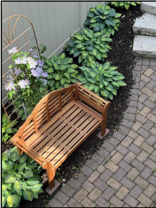
A bird's eye view of Jo Waterman's hostas and clematis