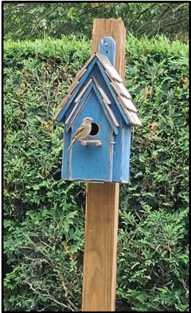
Karon Quigg sent two bird pics