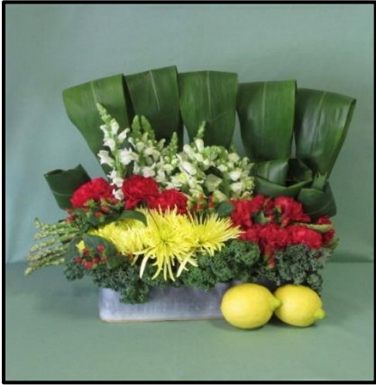
A Floral Design in Mexico's Flag Colors