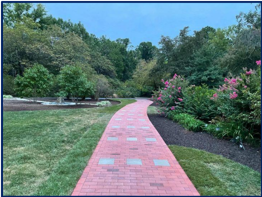
NGC's Path of Success at its Headquarters in St. Louis, Missouri