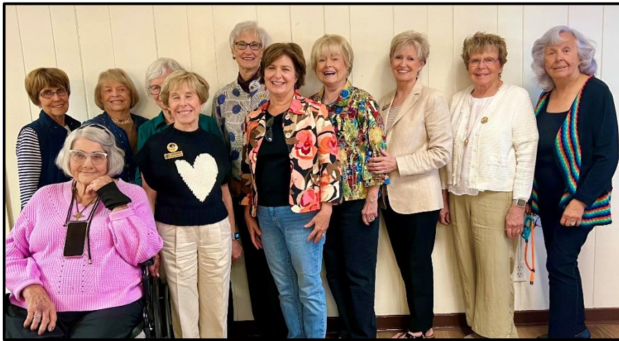
SGC's Attendees at the AFGC Central-Eastern District Meeting on November 13th