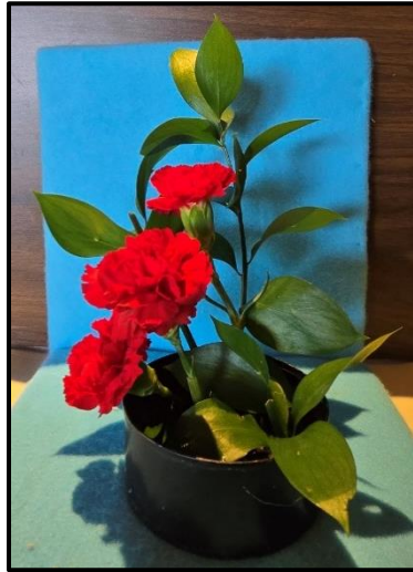
Carol Parrott's Example of a Small Design