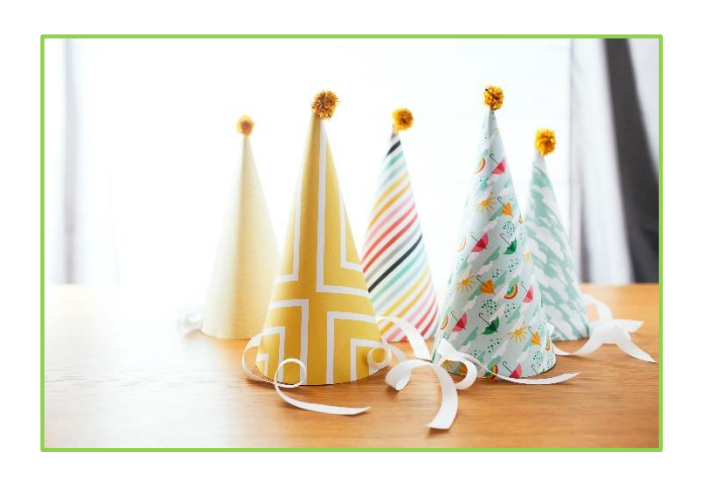
Happy New Year!

Cycads can heat up and release an offensive odor that discourages the wrong pollinators from eating the seeds. Small bees, beetles and birds can digest their highly poisonous red, purple and yellow seeds. Cycads grow very slowly but they can live 1,000 years.