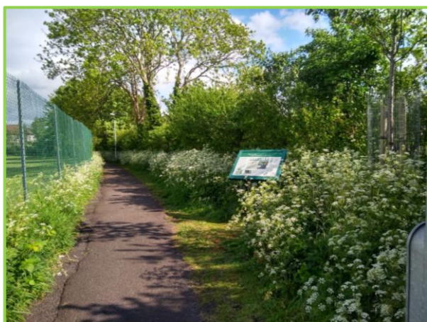
Picture, with dedication sign, from the website of Phoenix Hedge Preservation Group.)

British hedges were and still are created using a variety of shrub or tree material. One of the best-known hedges is the Phoenix Hedge, an 800-year-old specimen located in the outskirts of Bristol, England, which is 295 feet long and composed of ash, elm, and dog rose ( Rosa canina ). (See below.)