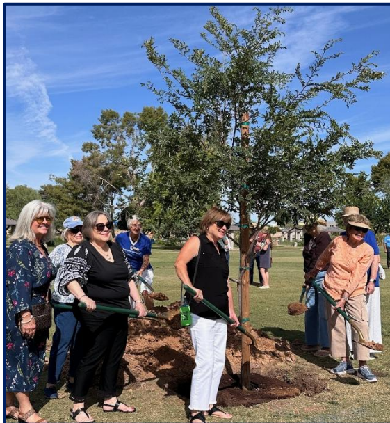
SGC members at the Arbor Day planting