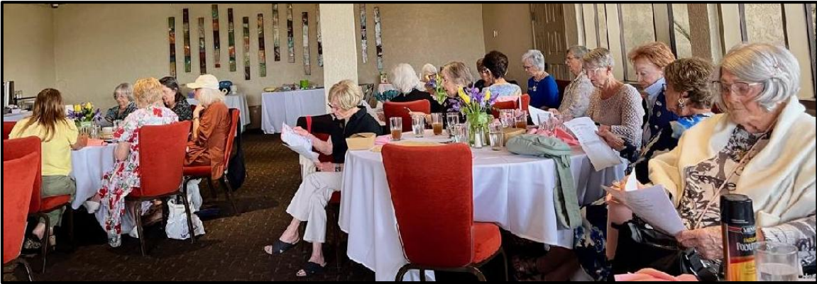
SGC Members at the April meeting.