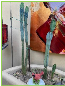
Susan's Volunteer Cacti Garden Today

She notes that "the middle one broke off and re-sprouted a couple times."