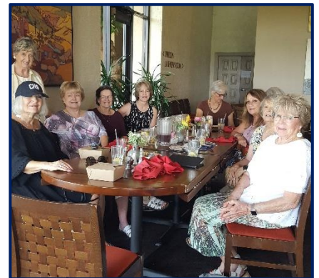
and in September