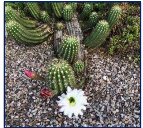
More cactus blooms in Helen Griller's garden