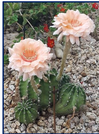
Cactus blossoms in Sherry's own garden