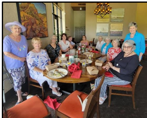
Some members at lunch in July