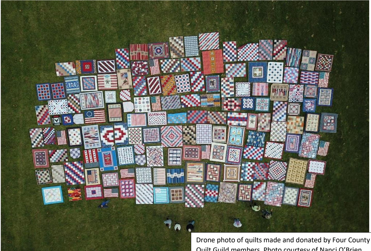
Drone photo of quilts made and donated by Four County Quilt Guild members.

Thank you, thank you, thank you to the Guild and its members who made this a very successful project!!