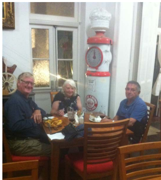
In the dining room