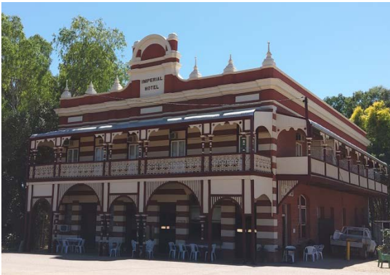
Imperial Hotel Ravenswood