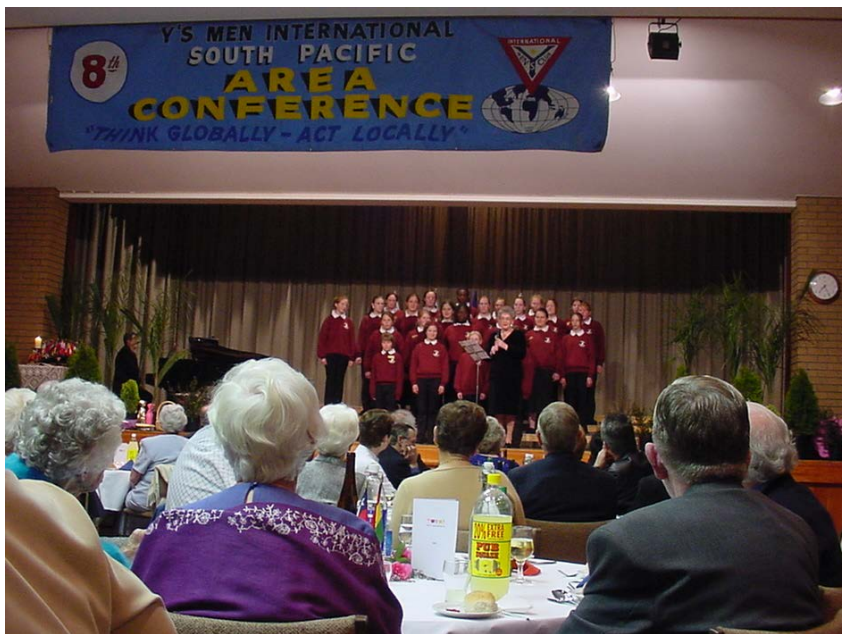
8 th South Pacific Area Conference 2003