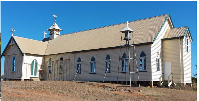
St Patrick's Church Ravenswood