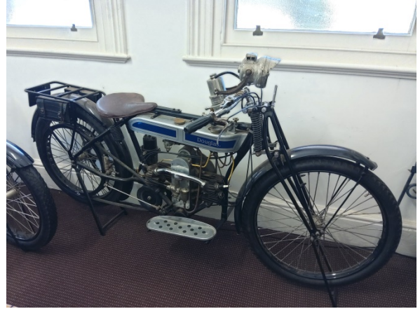
Railway Hotel Ravenswood dining room & old motorbikes as decorations