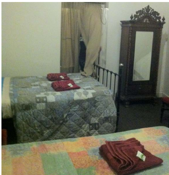
Second floor room with original furniture