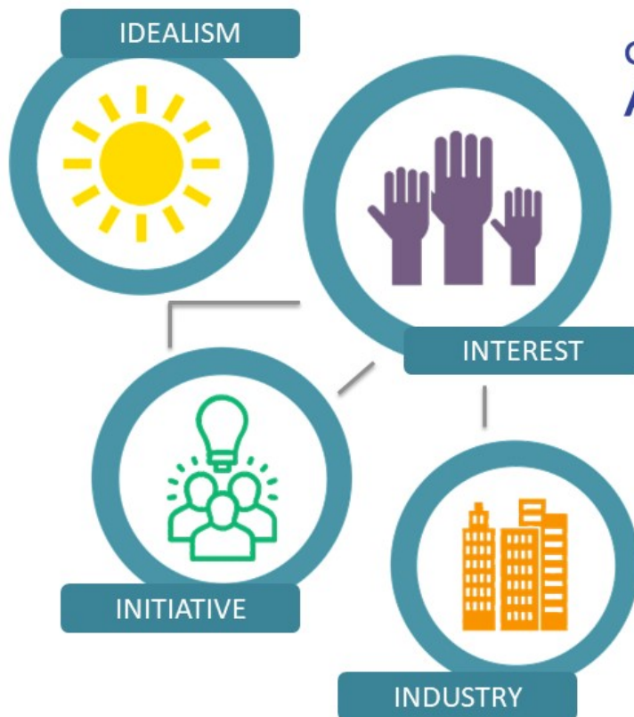
CHART OF YMI A YMI CLUB MEMBER IS