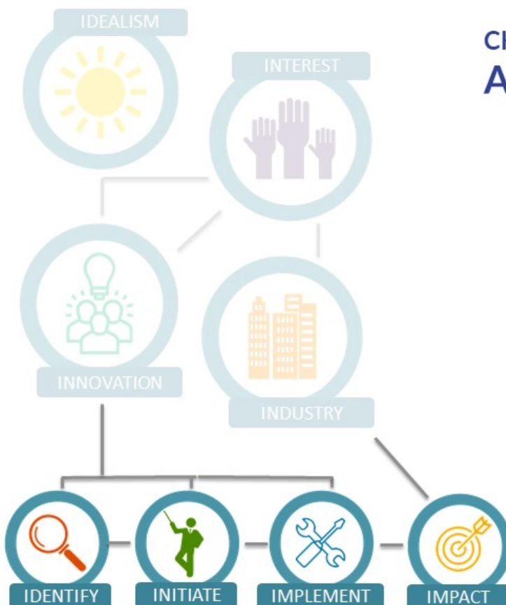
CHART OF YMI A YMI CLUB MEMBER: