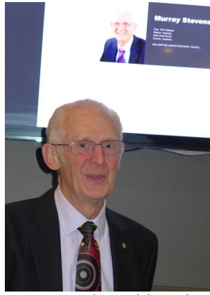
However when his picture appeared on the screen it all became clearer.