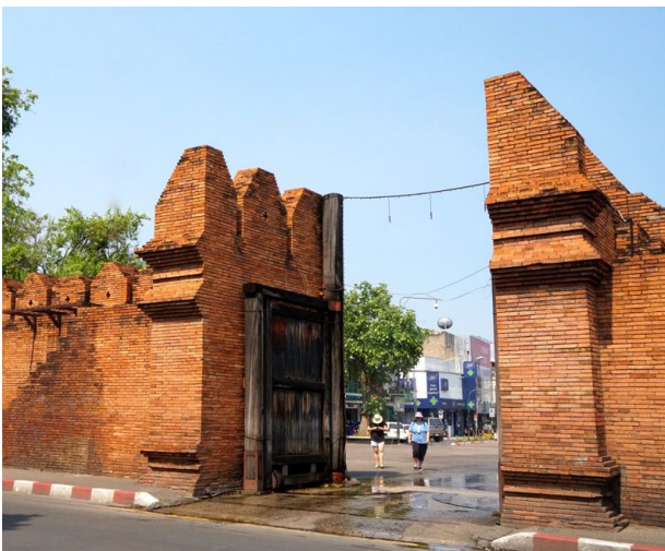
Tha Phae Gate in the Eastern Wall of the old city dates from 1296 when Chiang Mai was founded.

After the meal your editor showed some pictures of Chiang Mai and Bangkok, Thailand from a visit in April 2019. The original city of Chiang Mai is of a square plan with both a city wall and a moat or canal surrounding the old part.