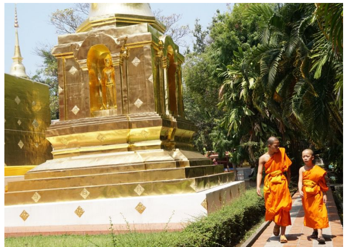
Young monks at Wihan Lai Kham Buddhist Temple Chiang Mai

From Kingswood Bristol Bulletin; and I thought they spoke English: Olny srmat poelpe can raed tihs.