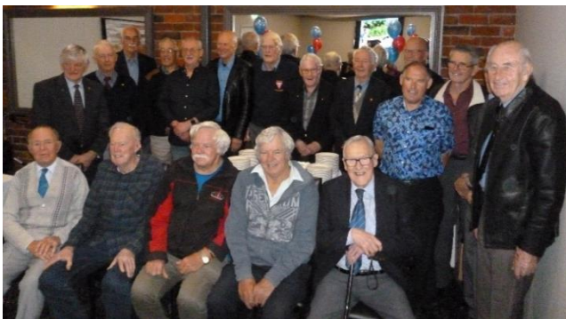
Eighteen members attended the Celebration Dinner