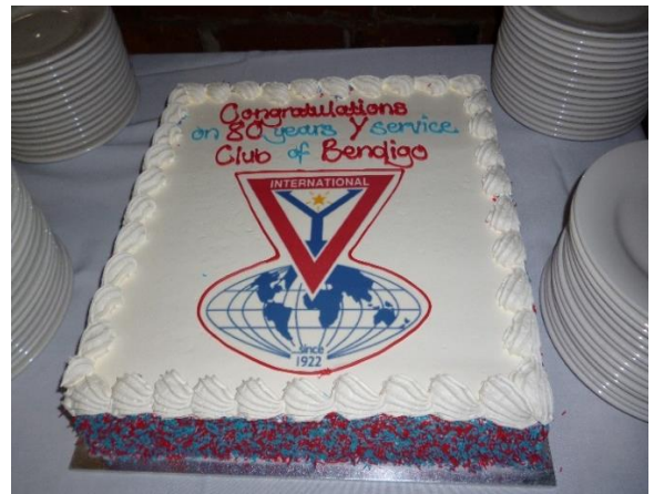
The celebratory cake