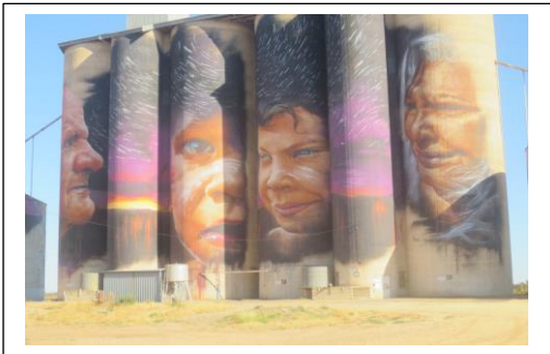
Silo Art at Sheep Hills