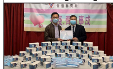
Hong Kong Club