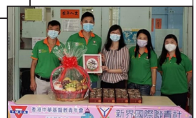
New Territories Club