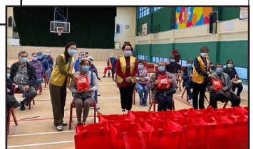
Island South Club