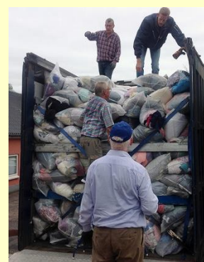
Used cloths collected in Denmark being sent for recycling