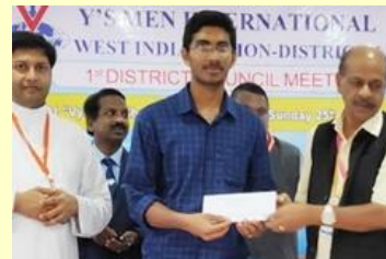
Educational assistance to a needy youth