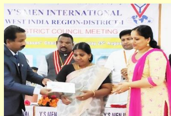
Financial help to a cancer patient