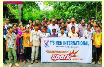
Youth development camp 'Spark'