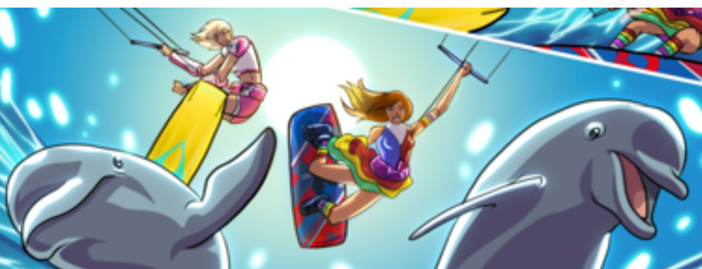
Image-based storytelling is a powerful educational tool. Comics are probably more able to combine story and information simultaneously, more effectively and seamlessly, than almost any other medium. After all, the brain processes images 60,000 times faster than it processes text.

The Ocean Defenders stand as a beacon of hope to a beautiful and clean ocean through our own personal action. The stories flow through a dialogue between the conservation groups, brands, writers and visual artists into short stories and news paired with animated graphics and real life solutions.