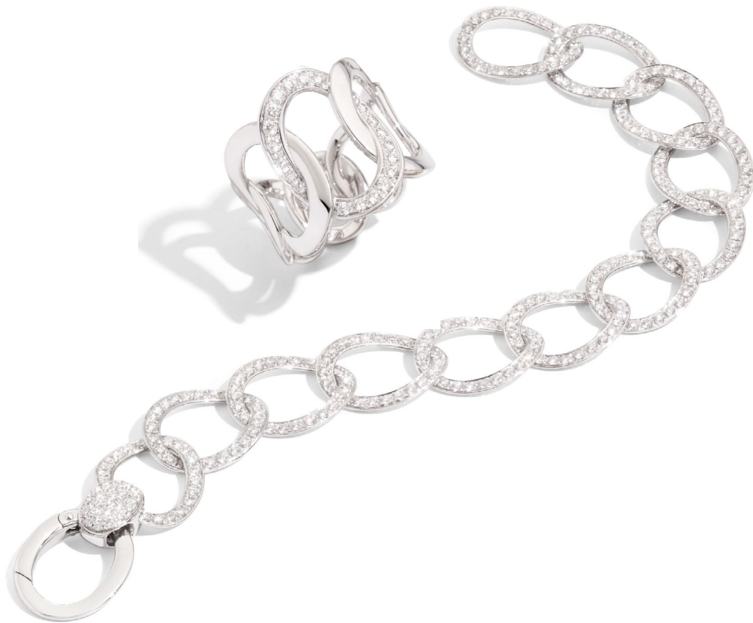
Brera ring in white gold with diamonds. Brera bracelet in white gold with diamonds.