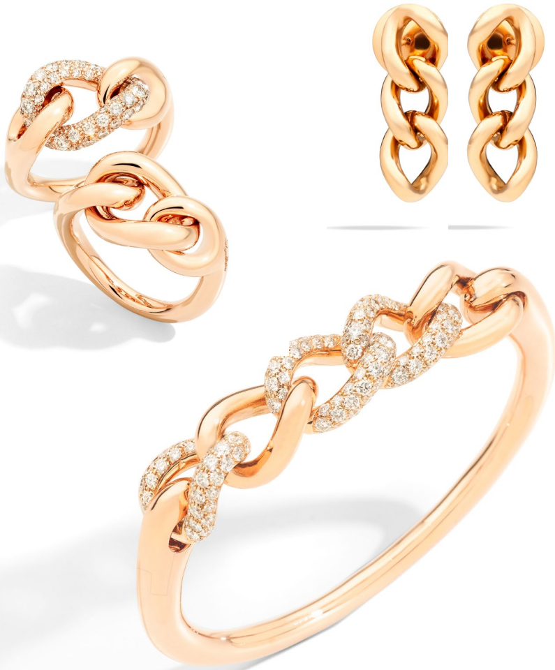
Catene earrings in rose gold. Catene bracelet and rings in rose gold and diamonds.