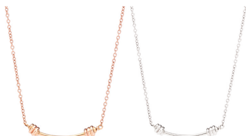
Mini Choker in rose gold Euro 290