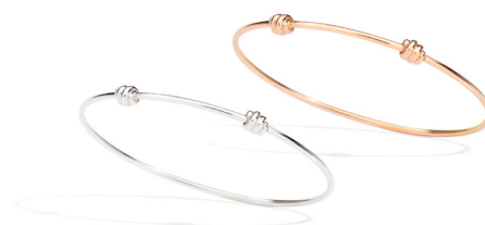
Bangle in rose gold Euro 610 Bangle in silver Euro 190