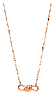
9K rose gold choker with 9K rose gold mini knot charm, 9K rose gold platelet Euro 290