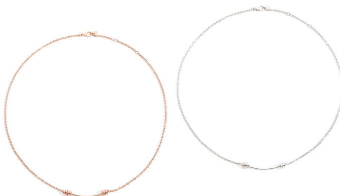
Nodo necklace in rose gold Euro 610