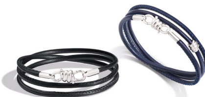
Nappa and silver bracelet - 3 rounds - Euro 190