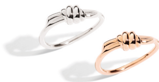
Silver ring Euro 110 Rose gold ring Euro 220