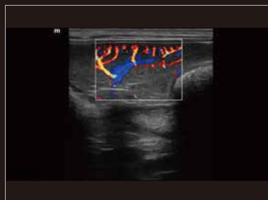
Spleen blood flow of canine