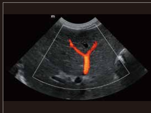
Portal Vein of canine