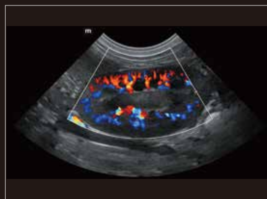
Renal blood flow of canine