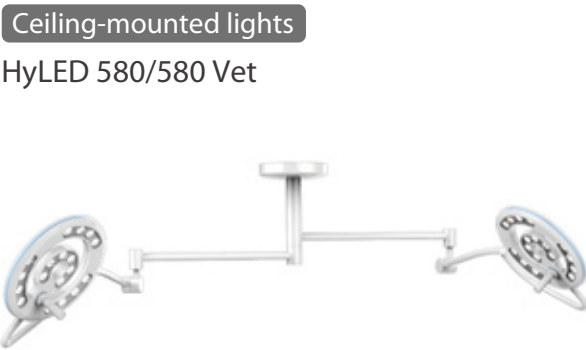
Ceiling-mounted lights HyLED 580/580 Vet