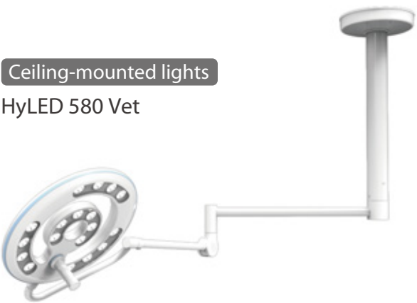
Ceiling-mounted lights HyLED 580 Vet

Long service life: LED bulb service life up to 60,000 hours (equal to 6 years of continuous lighting)