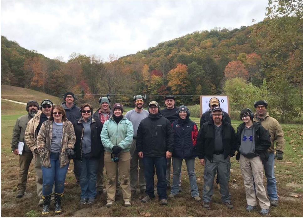
BULWARKS FOUNDATIONS OF THE SELF-DEFENSE PISTOL CLASS IN MT. STERLING. OCT 17