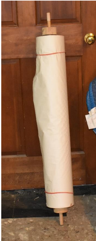
Flame Retardant Paper – Almost 1000 ft.