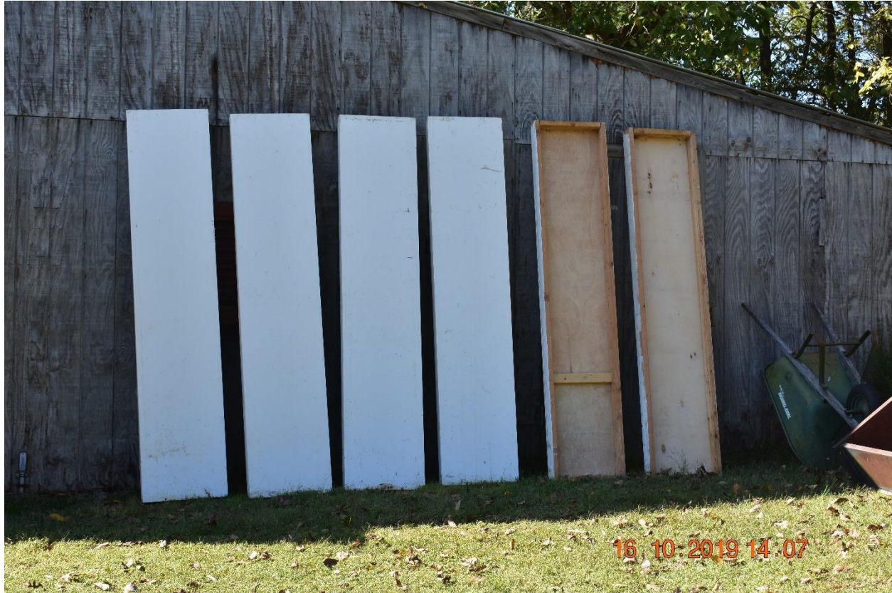
Photo includes just a few sections.

Also 3 sections 14" wide by 96" high – includes a plywood section with a hinged door to allow access from back of booth- Set up includes struts to stiffen structure and overhead front fascia piece. This setup makes a 10 foot deep by 20 foot wide booth. Also includes just less than 1000 feet by 36" wide white flame retardant paper which arenas will require.