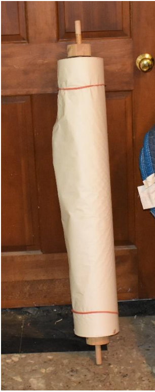
Flame Retardant Paper – Almost 1000 ft.