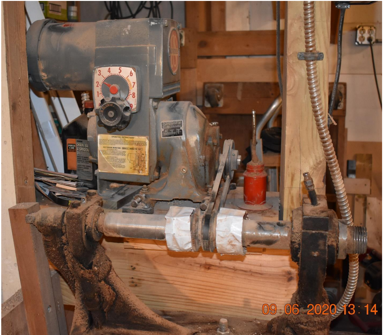
1 H.P. 3 Phase Motor - Adjustable Speed Pulley