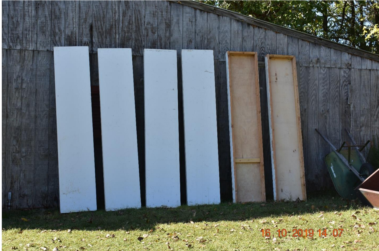
Photo includes just a few sections.

Also 3 sections 14" wide by 96" high – includes a plywood section with a hinged door to allow access from back of booth- Set up includes struts to stiffen structure and overhead front fascia piece. This setup makes a 10 foot deep by 20 foot wide booth. Also includes just less than 1000 feet by 36" wide white flame retardant paper which arenas will require.