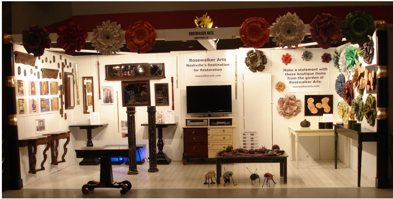
Full 20' wide by 10' deep booth setup