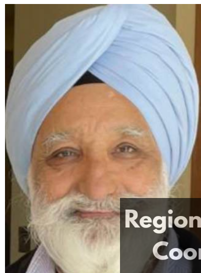
Regional Keertan Coordinator