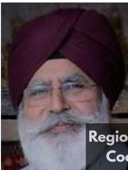
Regional Keertan Coordinator