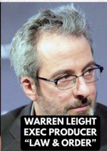
WARREN LEIGHT EXEC PRODUCER "LAW & ORDER"