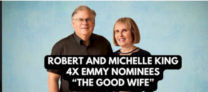
ROBERT AND MICHELLE KING 4X EMMY NOMINEES "THE GOOD WIFE"