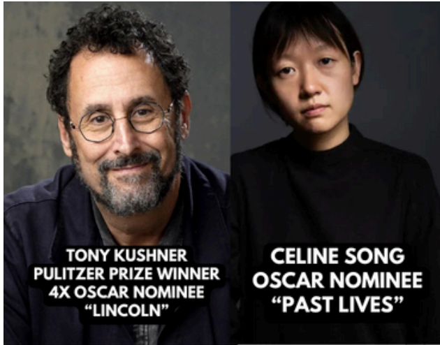
TONY KUSHNER PULITZER PRIZE WINNER 4X OSCAR NOMINEE "LINCOLN"