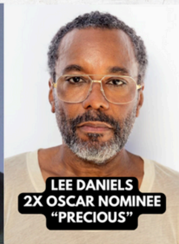
LEE DANIELS 2X OSCAR NOMINEE "PRECIOUS"