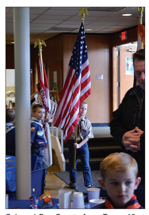
Cub and Boy Scouts from Troop 13 at St. Columbkille Parish carry in the U.S. and troop flags during the ceremonies to mark their new charter Oct. 13.