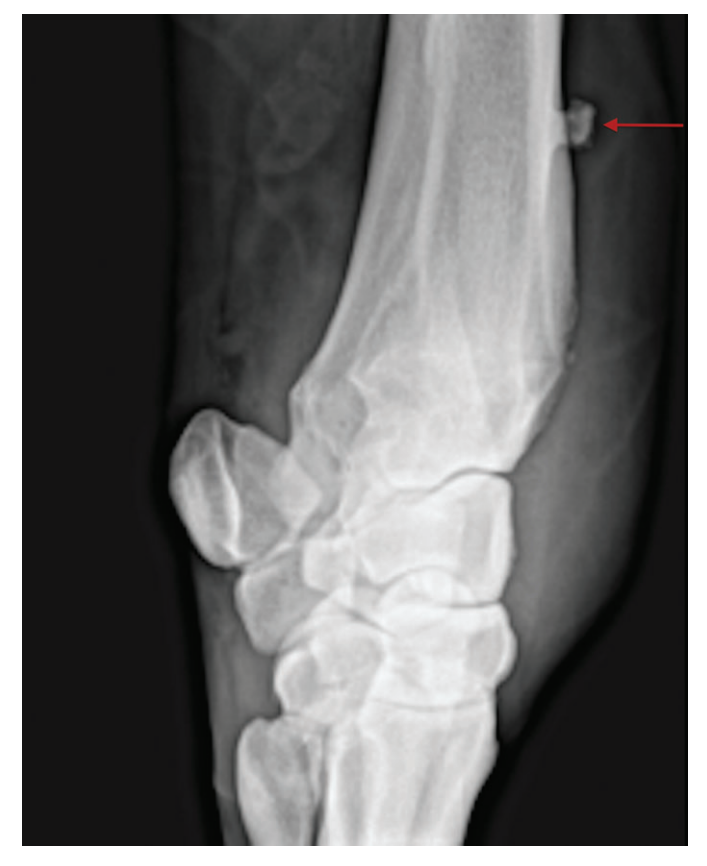
Figure 1. A 30-degree dorsolateral palmeromedial oblique view of the right carpus showing the osteochondroma (arrow) approximately 5 cm proximal to the physeal remnant on the cranial aspect of the distal radius.

Dublin, Ireland) twice daily, gentamicin sulfate 6.6 mg/kg IV (Gentagect 10%, Franklin Pharmaceuticals, Co., Meath, Ireland) once daily, 4.4 mg/kg phenylbutazone IV (Phenylarthrite, Vetoquinol Ireland Ltd, Dublin, Ireland) once daily and a single dose of tetanus antitoxin 1500 IU IM (Intervet Ireland Ltd).