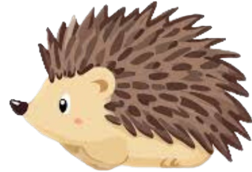
Holly, PHQ # 48, PMWJD Grand Bethel Honored Queen