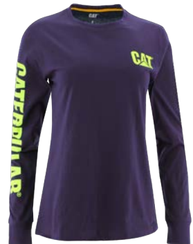
Purple Velvet 19-3725