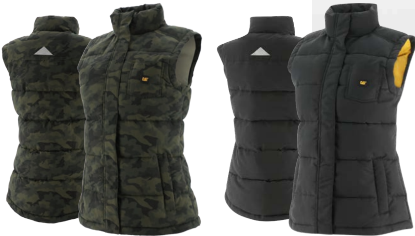
Night Camo-Marshland 12907

FIT: Regular Fit FABRIC: Self: Micro Peach, 100% Polyester with Acrylic PU Laminate, 3.4oz (115GSM) Insulation: Synthetic Down Lining: 100% Polyester, 240T