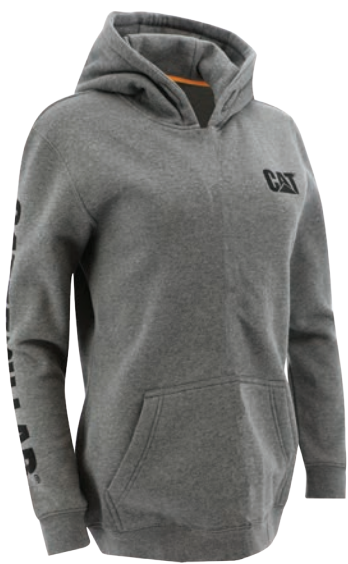
Dark Heather Grey 10123