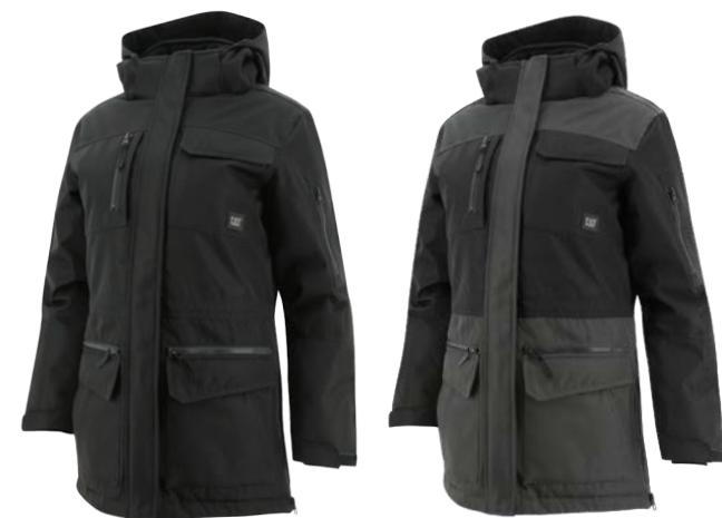
Black 10158 Magnet-Black 12976