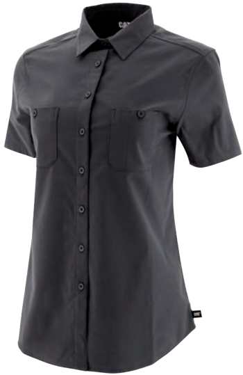
Black Oxford 12917