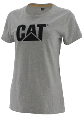
Heather Grey 10122