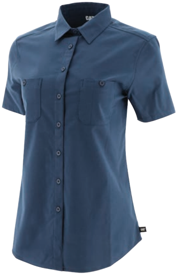
Detroit Blue Oxford 12918