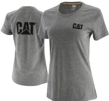
Dark Heather Grey 10123