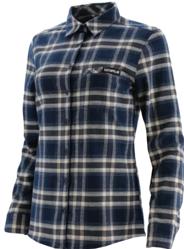
Navy/Dark Earth 12974