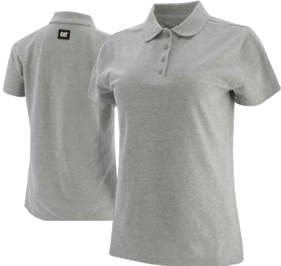
Heather Grey 10122