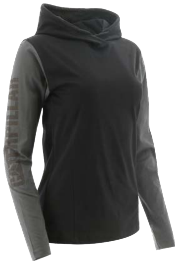
Black-Dark Shadow 11110