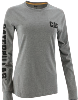
Dark Heather Grey 10123