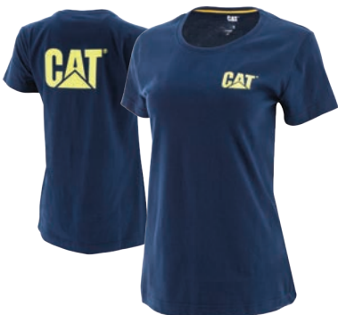
Detroit Blue 10118