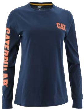
Detroit Blue 10118