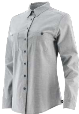
Denim Blue Oxford 12919