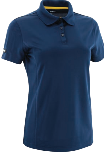
Detroit Blue 10118