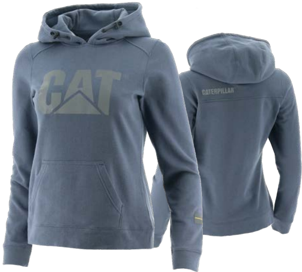
Faded Navy 10958