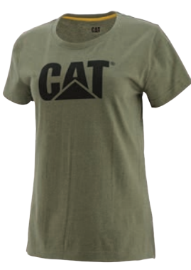
Marshland Heather 11063