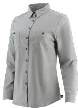
Charcoal Oxford 12920