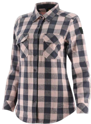
Faded Navy/Lilac 12916