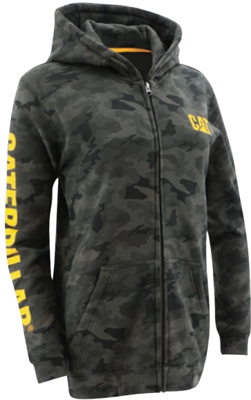
Night Camo 11790