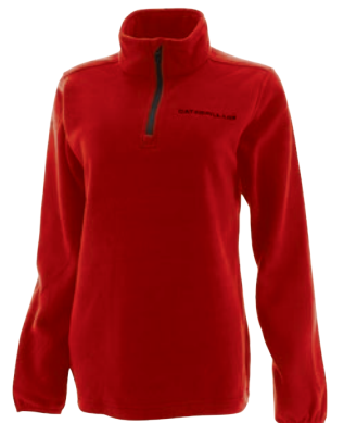
Hot Red-Black 13235