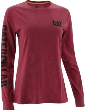
Brick Heather 12123