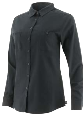
Black Oxford 12917