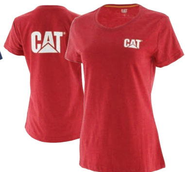
Hot Red Heather 13003