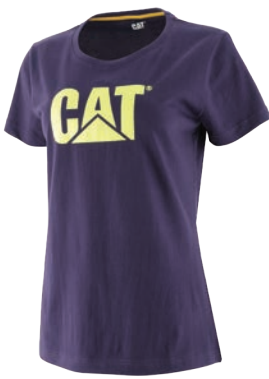
Purple Velvet 19-3725