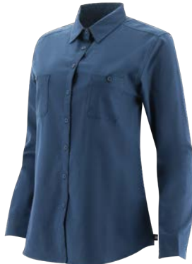
Detroit Blue Oxford 12918