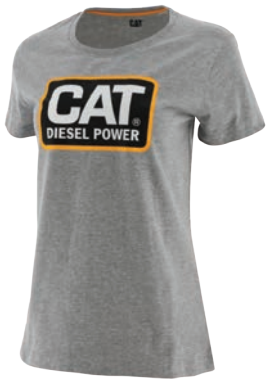
Heather Grey-Yellow 13091