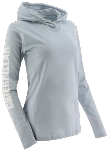
Blue Fog 12078