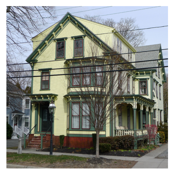
Point of Interest

This late Victorian house was built for Charles Greene, who was the owner and publisher of the Bristol Phoenix newspaper from 1862-93. Greene was also the first president of the Rhode Island Press Association, Sheriff of Bristol County from 1875-1877, and member of the Bristol Town Council from 1879-1881. His house was no less significant in its extremely fine carved details, octagonal front bay, and side porches, all hallmarks of Victorian architecture. The color scheme is not original, but features the bright colors and painted details that were commonly found on similar houses of the time.