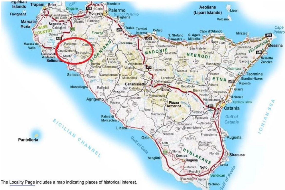
The Locality Page includes a map indicating places of historical interest.

to have been severe enough to warrant experiencing a lifetime growing up in a Sicilian family. I have experienced some minor discrimination in my life due to my ancestry. My dad's dad immigrated from Palermo.