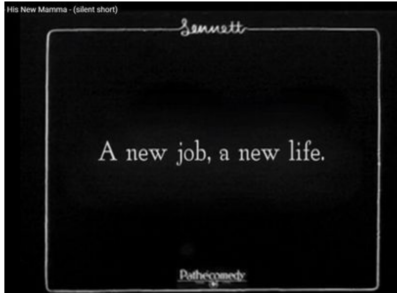
Inter-title from HIS NEW MAMMA, 1924