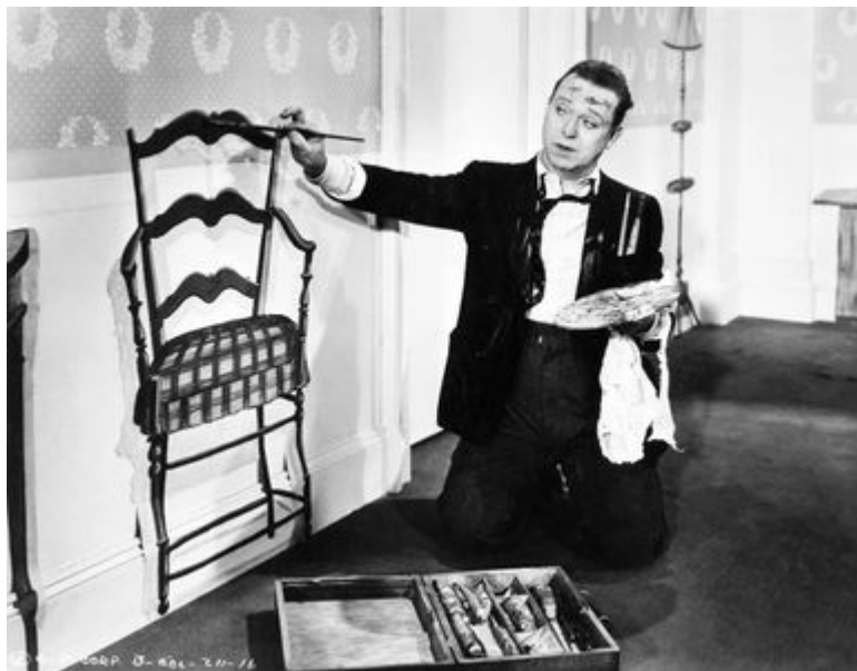
I DON'T REMEMBER, 1935 ...Harry is an artist with a terrible memory. Doesn't even recognize his own mother!