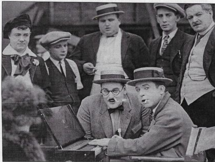
A candid shot of Harry Langdon and Vernon Dent on the set of The Hollywood Kid (Sennett, 1924).

ing between takes while the director and crew set up the next scene. The actors would have to stay in costume and be available at a moment's notice. Some folks amused themselves by talking, playing cards, gambling, or finding a shady spot. The musically inclined passed the time by singing or playing instruments.