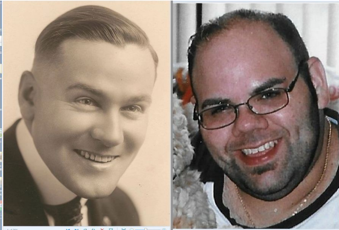
Same smile, eyes look similar including coloring (same blue as mine). My brother is heavier here than Vernon but you can see they both have a slight cleft in their chins and other similar facial features.