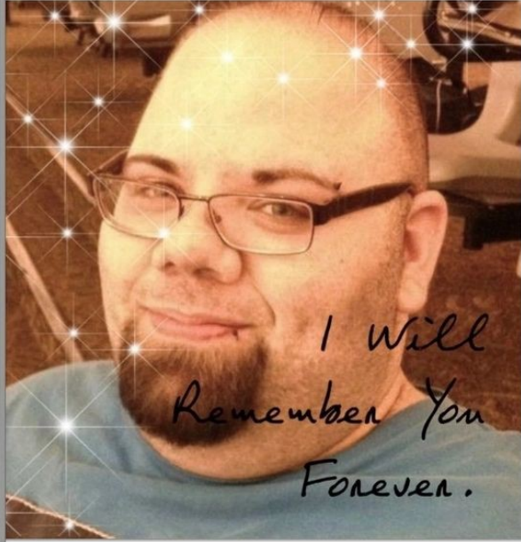
Photo of Vernon from Bill Cassara's book, VERNON DENT: STOOGE HEAVY