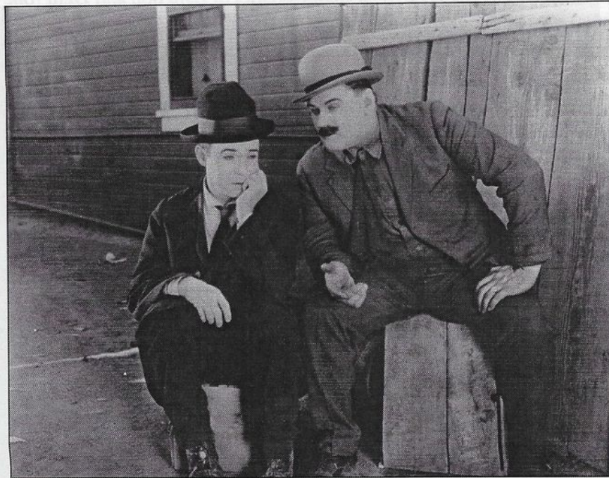
Harry Langdon and Vernon Dent in Plain Clothes (Sennett, 1925). This was taken two years before Stan Laurel and Oliver Hardy became a team.