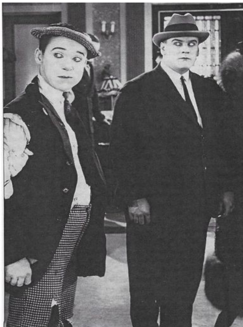
A youthful Vernon Dent gives Harry Langdon "The Look" in their very first screen appearance together. Picking Peaches (Sennett, 1924).

Harry and Vernon may have crossed paths as early as 1913 when Harry was in vaudeville. Vern was 18, Harry was 29. (Hayde & Harter, LITTLE ELF Pg. 51)