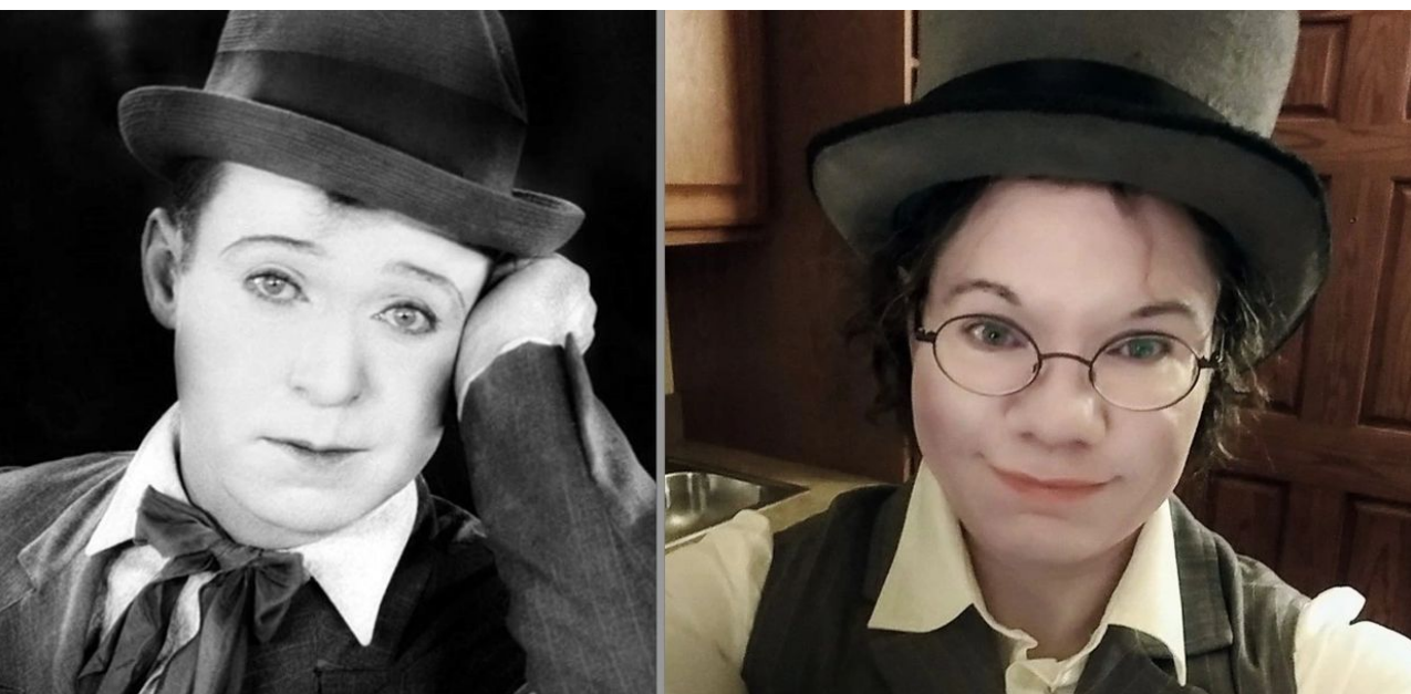
I'm on the look out for a hat like his. I did manage to find a top hat just like the one he wore in Zenobia.