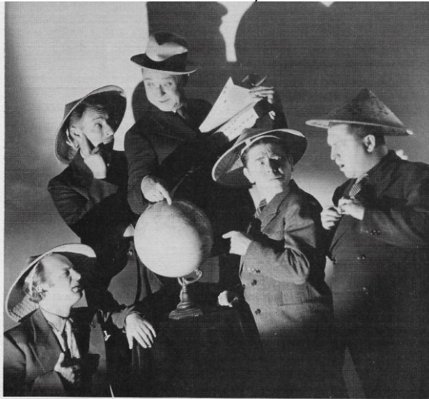
Columbia comedians ponder global affairs in this rare 1942 publicity still. Pictured l. to r.: Larry Fine, Monte Collins, Harry Langdon, Moe Howard, Curly Howard.

wore it out...dripped grape jelly inside it, of course I drew all over it (wish I'd kept it to see what I drew in there).