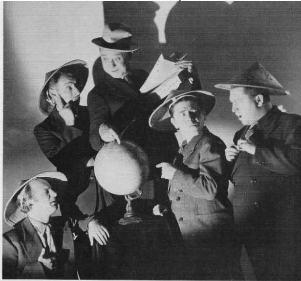
Columbia comedians ponder global affairs in this rare 1942 publicity still. Pictured l. to r.: Larry Fine, Monte Collins, Harry Langdon, Moe Howard, Curly Howard.

wore it out...dripped grape jelly inside it, of course I drew all over it (wish I'd kept it to see what I drew in there).