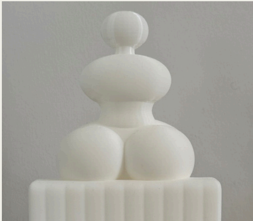
The Visible Woman

Luli's sculptures have been prominently displayed as the Argentine selection of HispaFest 2024. Her works range in material from bronze, to giant inflatables to 3D printing.