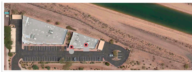
Property purchased on November 16, 2022

Our proposed renovation and operating budgets can be found on pages 7-9 . All numbers are estimated. Any dollars raised over our goal amount will be used diligently to further our operations and enhance the quality and level of care that we provide to our animals. Opportunities for naming rights can be found on page 10 .