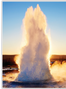
GEOTHERMAL AREA, ICELAND

• DAY 12: FLIGHT HOME – After breakfast, we transfer to Dublin Airport for our flight home. (B)