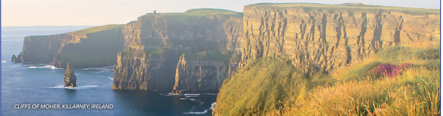
CLIFFS OF MOHER, KILLARNEY, IRELAND

*Package shown is valid for select travel on 6/15/22 – 6/26/22, and is subject to availability, terms and conditions at time of booking. Package includes roundtrip air from Boston and government-imposed fees and taxes which are subject to change without notice. Additional airline restrictions, including, but not limited to, baggage fees (see iflybags.com for specific details). Please contact the airline directly for details and questions. AAA Travel reserves the right to change or cancel itineraries and other components whenever it is deemed necessary. If this occurs, every effort will be made to offer alternate dates, hotels or other tour components. *$100 off per person offer must be booked and deposited by September 15, 2021. AAA does not assume responsibility for any errors or omissions in the content of the offers displayed. Contact a AAA Travel counselor for best available rate. Restrictions may apply. TRA.498812.20