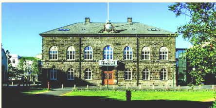
PARLIAMENT HOUSE, REYKJAVIK