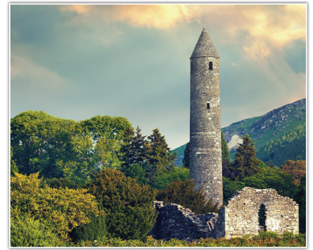
GLENDALOUGH IN COUNTY WICKLOW, IRELAND