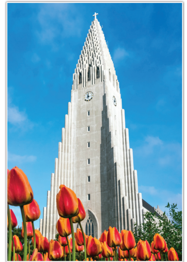
HALLGRÍMSKIRKJA CHURCH, REYKJAVÍK