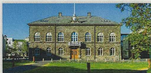
PARLIAMENT HOUSE, REYKJAVÍK