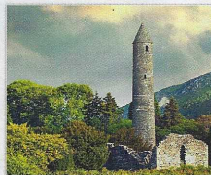
GLENDALOUGH IN COUNTY WICKLOW, IRELAND