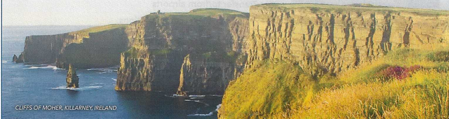
CLIFFS OF MOHER, KILLARNEY, IRELAND

*Package shown is valid for select travel on 3/11/21 – 8/22/21, and is subject to availability, terms and conditions at time of booking. Package includes roundtrip air from Boston and government-imposed fees and taxes which are subject to change without notice. Additional airline restrictions, including, but not limited to, baggage fees (see iflybags.com for specific details). Please contact the airline directly for details and questions. AAA Travel reserves the right to change or cancel itineraries and other components whenever it is deemed necessary. If this occurs, every effort will be made to offer alternate dates, hotels or other tour components. **$100 off per person offer must be booked and deposited by December 31, 2020. AAA does not assume responsibility for any errors or omissions in the content of the offers displayed. Contact a AAA Travel counselor for best available rate. Restrictions may apply. TRA-498812.20