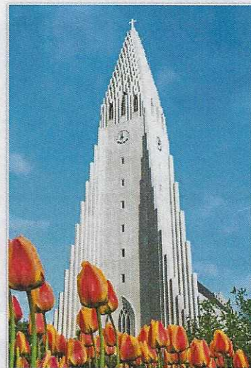
HALLGRÍMSKIRKJA CHURCH, REYKJAVÍK